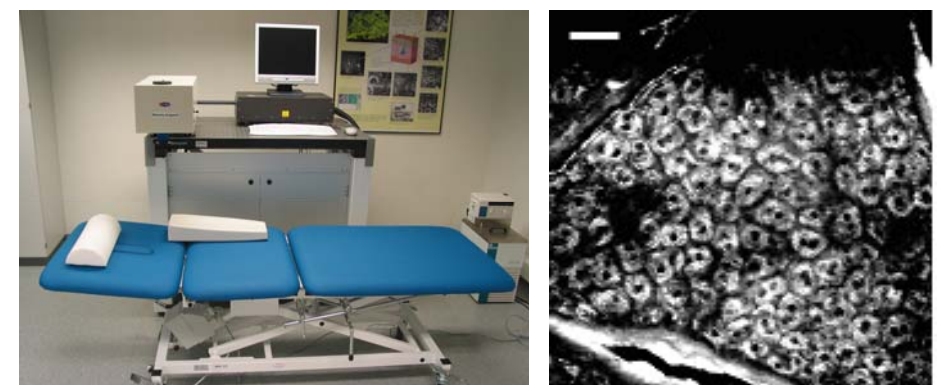
Figure 2. Left panel: "DermaInspect" system (box on the left of the optical table) with a pulsed femtosecond laser (box on the right of the optical table), and with a bedside. Right panel: MPM imaging of the epidermis layer of live skin. Note clearly resolved cells and cell nuclei. Scale bar, 20 \ \mu m .

fluorescence signal. Since fluorescence originates from a